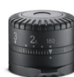
BTF ballistic turret flex