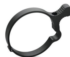
TL throw lever